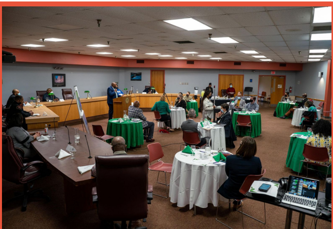
Stakeholder Luncheon March 2021