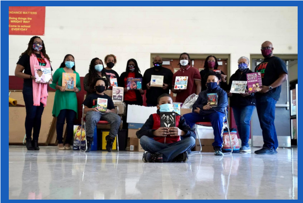
East St. Louis Rotary Club Book Donation March 2021

On March 6, 2021, the newly formed Rotary Club of East St. Louis donated 1,200 books to District 189's little libraries. The Little Libraries are station at every school campus in the city. For more information on how to join please email: estlrotaryclub@gmail.com