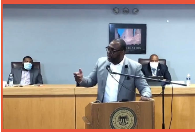
Mayoral Prayer Breakfast – Jan. 2021

The City of East St. Louis hosted their 2nd Annual Mayoral Prayer Breakfast with the theme "Finish What You Started." The mayor elaborated on the vision for East St. Louis 2021 and joined several members of the clergy in prayer for the community. The breakfast embodied energy between civic and faith leaders who prayed for spiritual consistency, spiritual obedience, faith, strength, and the birth of a renaissance for our City.