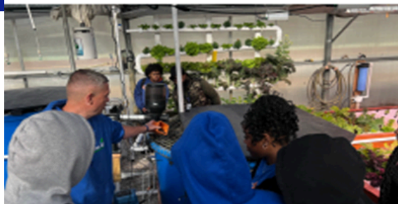
East St. Louis Sr. HS culinary students visit JJK FAN