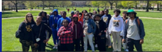
Wyvetter School of Excellence students visit UIUC