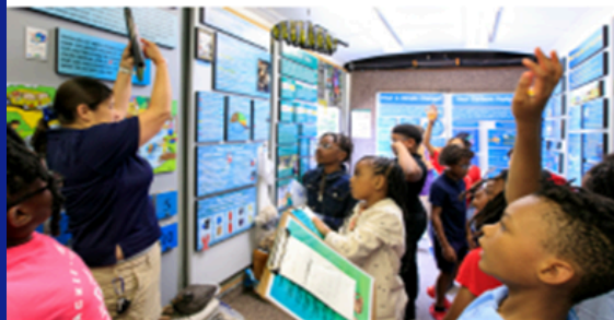
UIUC Traveling Science Center Visits JJK Foundation