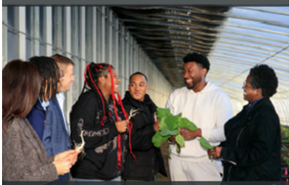
Interns meeting with CoBank professionals telling them about their work on collard research

JJK FAN, in partnership with the Donald Danforth Plant Science Center and funded by Boeing, offers summer internships to East St. Louis high school students, introducing them to careers in agriculture and food systems. Interns gain hands-on experience in labs, research and fieldwork while working with more than 20 professionals representing ag-tech, biosciences, and support professions like finance. To remove barriers, JJK FAN provides wrap-around services such as transportation, financial literacy training, academic check-ins, post-secondary and scholarship support, and more.