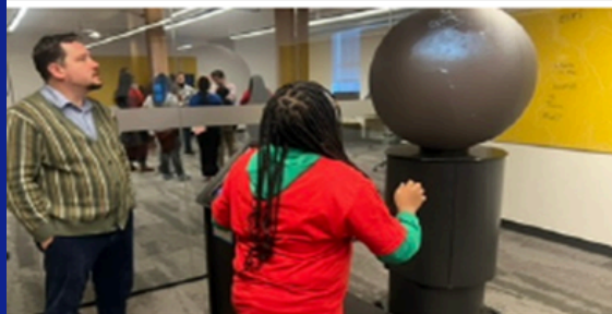
JJK Foundation students visit T-REX St. Louis